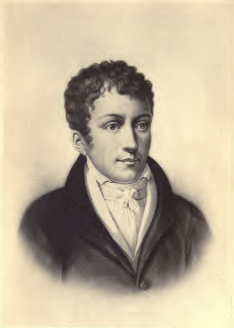
PIERRE JEAN GEORGES CABANIS.